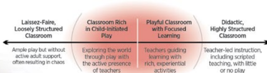
Figure 1. Early Childhood Instructional Continuum 10

a home-school communication loop, teachers can benefit from valuable information about each child's individual development and better understand knowledge that children bring to their learning. Teachers and families can work together to provide children with purposeful play that fosters deep learning, language development, and the essential skills that the New York State Learning Standards promote. Schools can help parents to know about what their children are learning, what they enjoy, and what they have mastered. In short, the New York State Learning Standards' new and rigorous expectations for students' learning reinforce the need for strong collaboration between schools and families in support of children's learning.