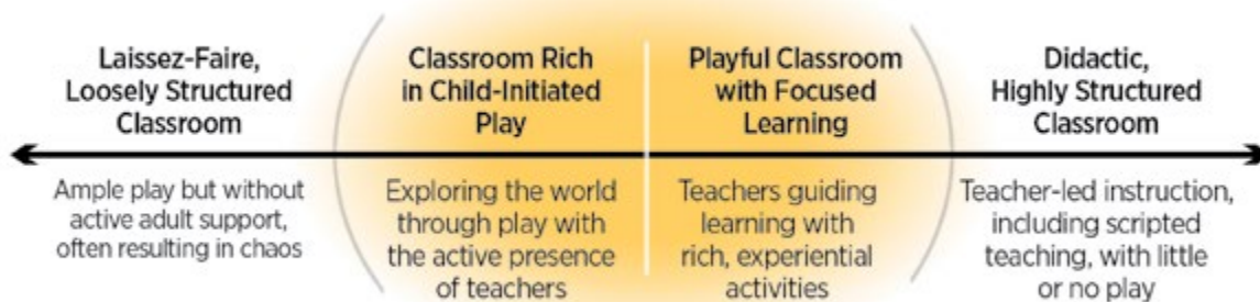
Figure 1. Early Childhood Instructional Continuum 5

In contrast to the balanced approach, studies suggest that teacher-directed classrooms can inhibit children's learning. For instance, when young children do not engage in dramatic play at school, behavioral challenges and expulsions increase. 2 Research has also shown that children - especially boys - in teacher-directed classrooms suffer more stress and are less motivated when compared to children in more child-initiated classrooms. 3 At the other end of the spectrum, unstructured classrooms are also ineffectual. Indeed, research affirms that neither didactic techniques nor hands-off approaches work. As displayed in Figure 1, a high-quality early learning environment strikes a balance between child-initiated play in the presence of engaged teachers and focused experiential learning guided by teachers. 4